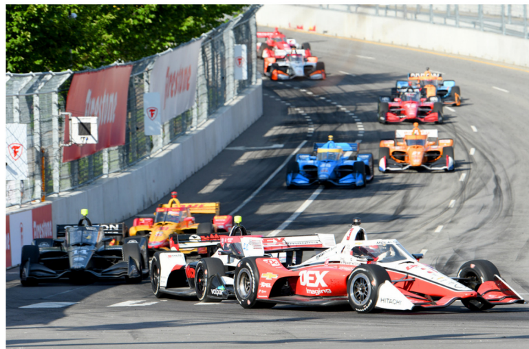
#3 Scott McLaughlin leads the field into turn 4 in downtown Nashville