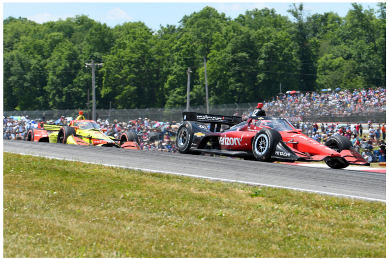
#12 Will Power ahead of #29 Devlin DeFrancesco in front of a large group of fans

Will Power, on the other hand, used cautions and tire strategy to his advantage by moving all the way up to 3rd after starting 21st and even dropping back to 27th after the early spin-out. Power started the race on the black tires, but switched to the softer red tires after pitting early on lap 10. The following caution helped Power make up time and put him on the same pit strategy as the leaders. From that point on, he was able to quickly gain several positions on the quicker tires. Power was unable to get by Alex Palou, who trailed McLaughlin for much of the race