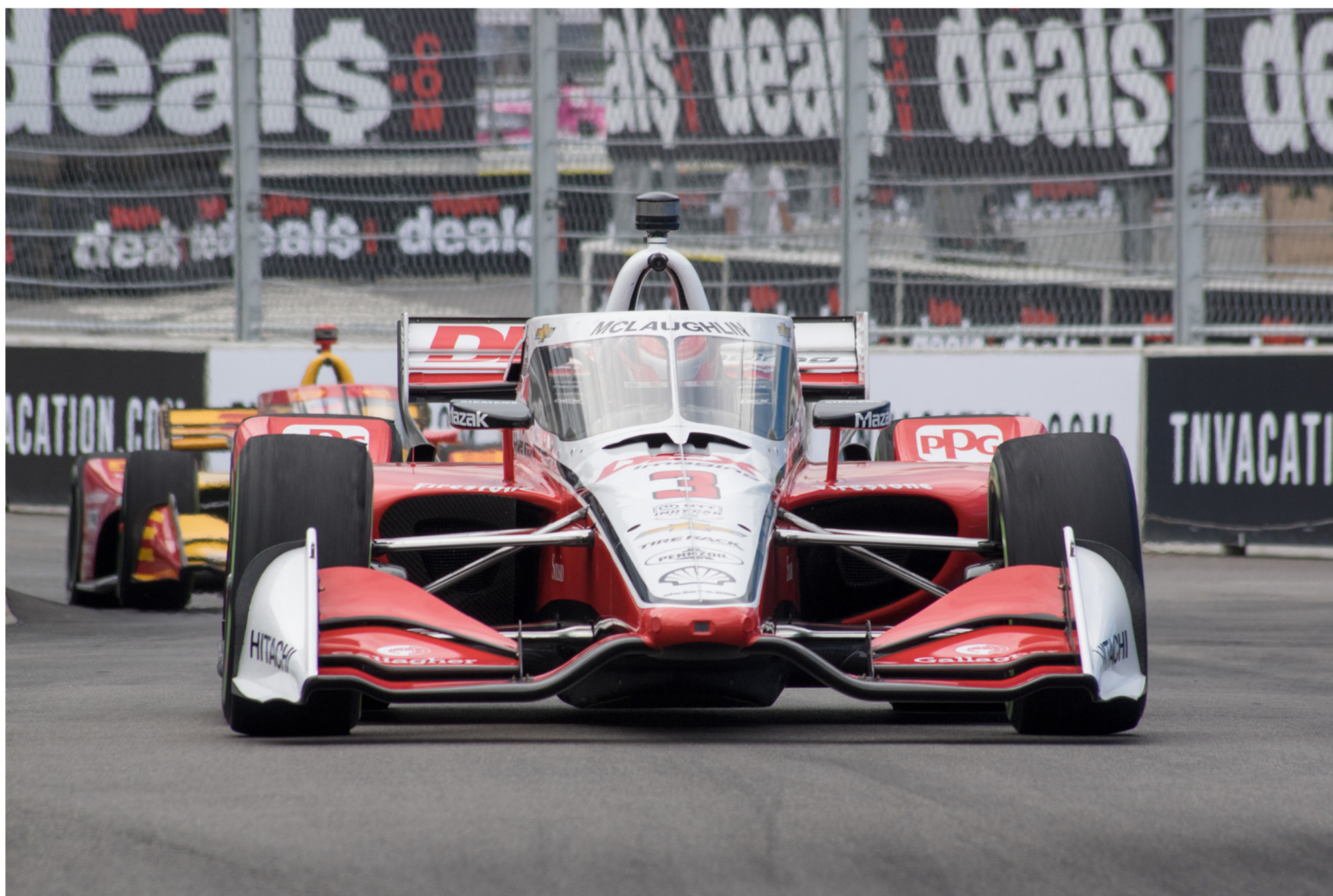
#3 Scott McLaughlin ahead of #28 Romain Grosjean

Points leader Will Power had his own issues, saying