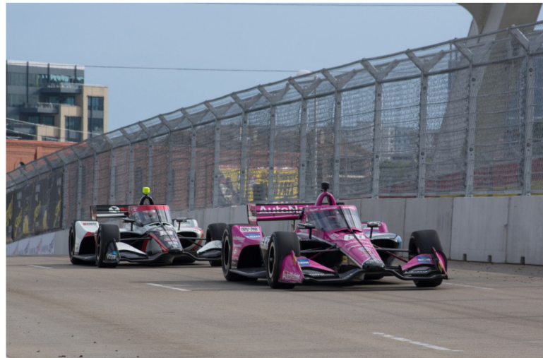
#60 Simon Pagenaud racing #18 David Malukas on the Korean War Veterans Memorial Bridge over the Cumberland River