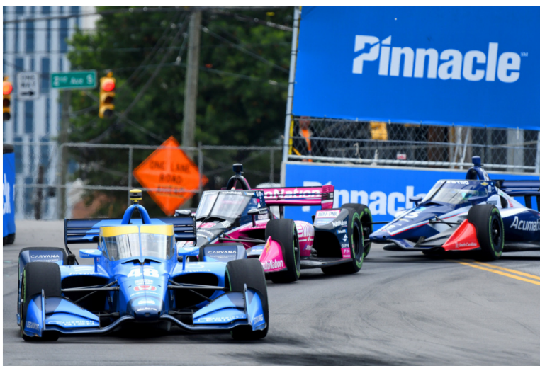
#48 Jimmie Johnson ahead of #06 Helio Castroneves and #16 Simona De Silvestro