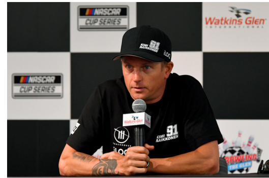
Kimi Raikkonen press conference

After being passed on the restart by Larson, Chase Elliott dropped to 5th but would recover to 4th by the end of the race. Elliott, the pole sitter, led the first 3 laps before being passed by Michael McDowell on lap 4. Elliott and the other Hendrick cars went with a 2 pit stop strategy and had to run the rain tires longer at the start of the race, which cost them track position to drivers on the faster slick tires. The