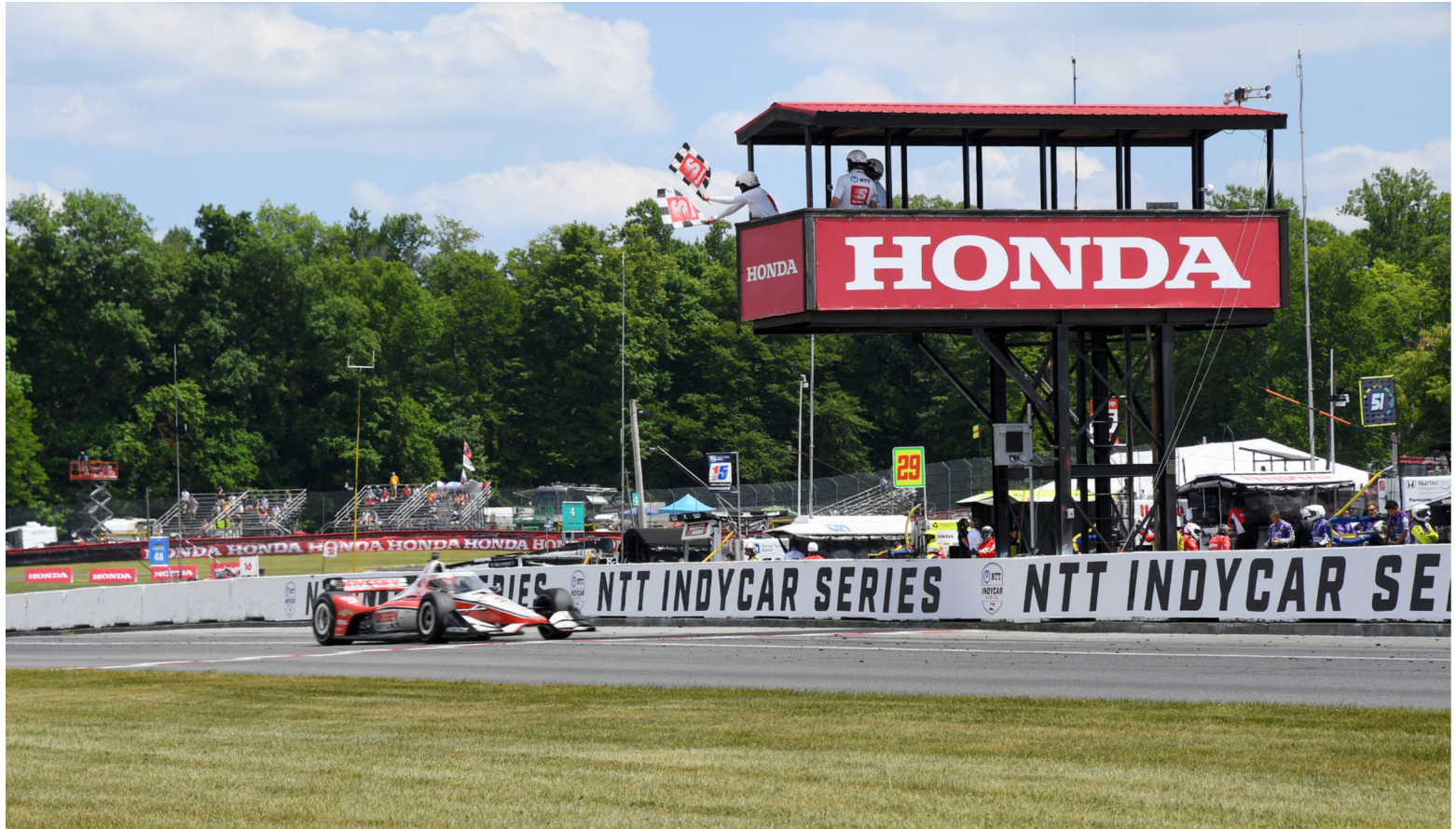
Scott McLaughlin crosses the finish line as the winner at Mid Ohio.