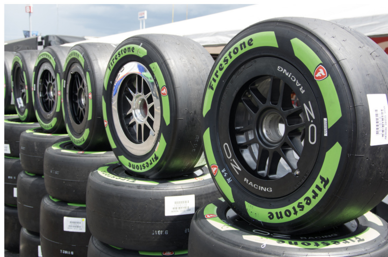
Sets of the debuting green sidewall alternate tire made partly from the Guayule plant, a desert shrub grown in the American Southwest