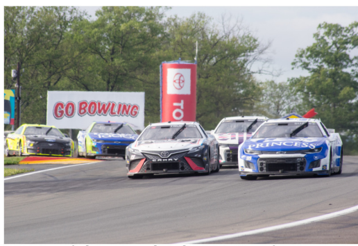
#99 Daniel Suarez leads #19 Martin Truex Jr. out of the Bus Stop

on four racing slicks, which allowed him to make up time on drivers who still had on the slower rain tires. Logano won stage 2 after passing David Gilliland and holding off Kyle Busch. After pitting between stages, Logano dropped back outside the top 20, but worked his way back into the top 10 and went from 7th to 3rd on the final two restarts. Logano's finish