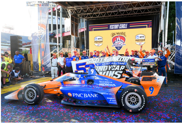
The Chip Ganassi Racing team celebrates Scott Dixon's record breaking 53rd IndyCar victory