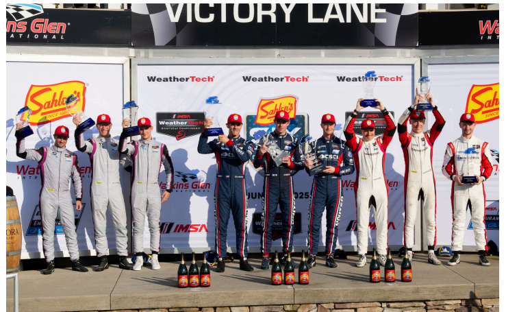
IMSA LMP2 Podium