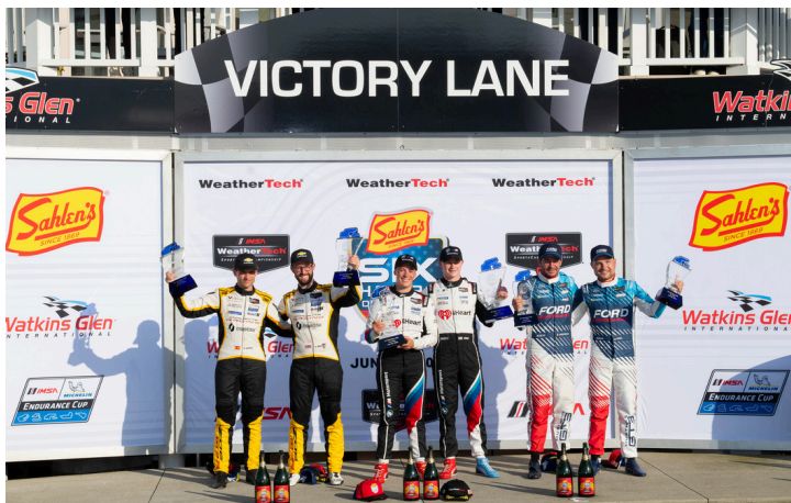
IMSA GTD Pro Podium