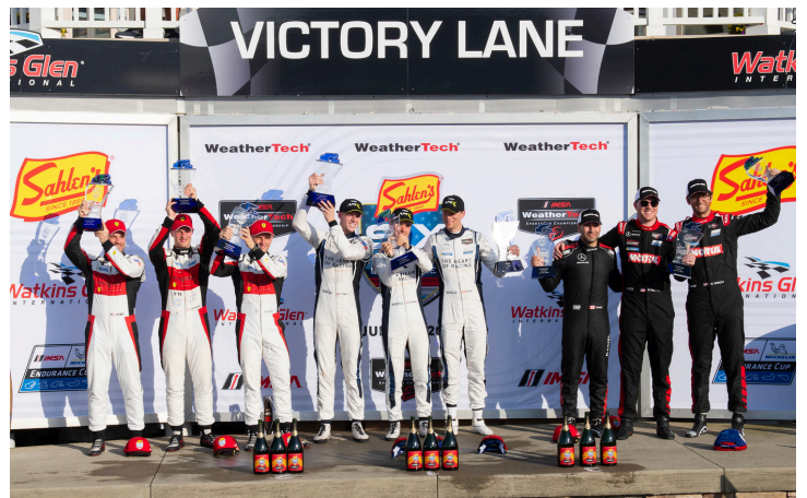
IMSA GTD Podium