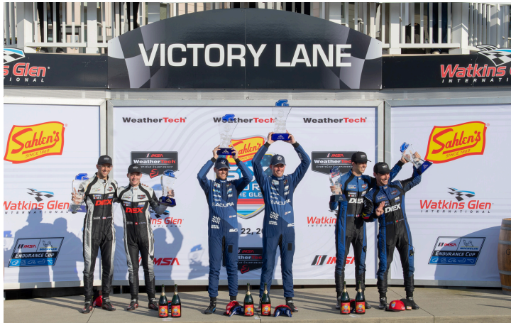
IMSA GTP Podium