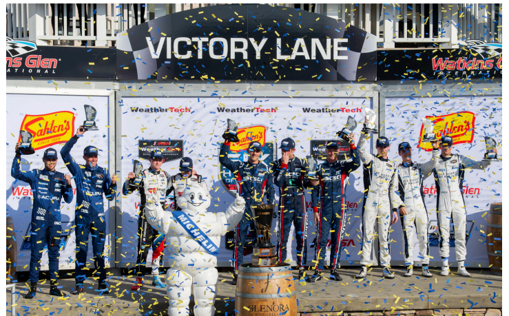
Michelin North American Endurance Cup Podium